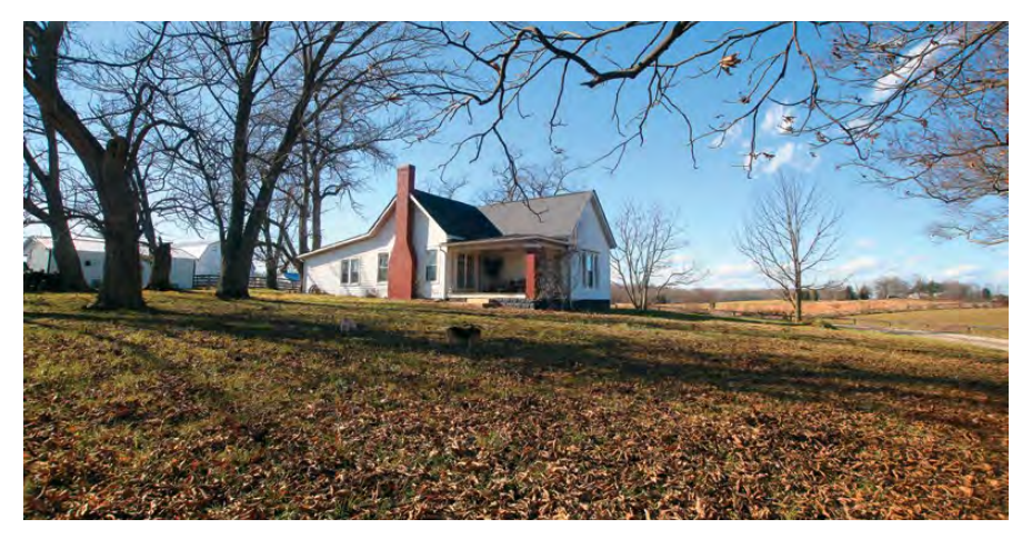
The original portion of the main house at Hidden Springs was a stagecoach stop