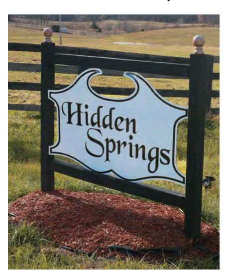
The Berryhills continue to make improvements to their Hidden Springs Farm

"The barn on this property wasn't there, but the house still was. It started out as a two-room log cabin. The floor joists are the cedar trees they took off the property. You don't see cedar trees that size anymore.